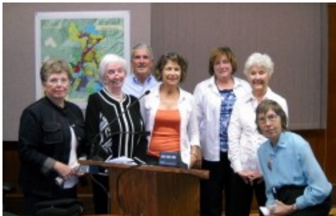
Pleased League Volunteers at the conclusion of the SLO Mayoral and City Council Forum.

The forum will be moderated by the League of Women Voters of San Luis Obispo County . The event will be held in the community room at the San Luis Obispo County Library from 6:00 to 7:30 pm. on October 14. Press release by SEA Change Oct. 5, 2010