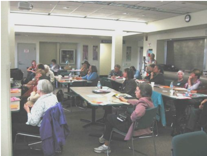
Picture from LWVC Conference