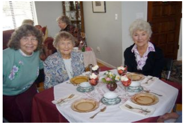
We're ready. This looks yummy!