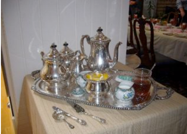
Twenty-six people joined us for tea, sandwiches, fruit and scones on April 2.