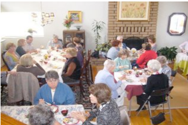
Classic tea settings of china, silver and linens for all.