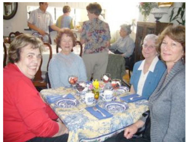
Good times with League friends.